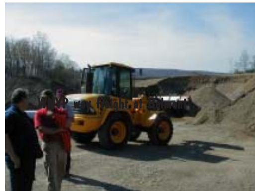
Muddy-WNY Stormwater Blues Conference April 26, 2004