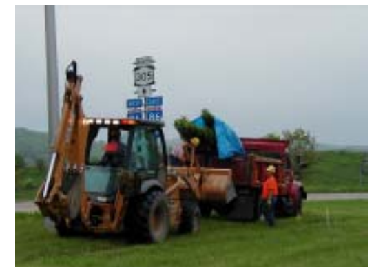
I-86 PRIDE Program Cuba plants tree islands

Southern Tier West continued its emphasis on development of the region's rail transportation system in 2004; focusing on providing additional freight shipping options for the region's employers through the rail operator Western New York and Pennsylvania Railroad Company. During 2004, Southern Tier West continued to provide contractual administrative support to the Chautauqua, Cattaraugus, Allegany and Steuben Southern Tier Extension Railroad Authority (STERA). Southern Tier West also provided rail access assistance to current and potential rail shippers along the regions rail lines, worked with communities to assist them with grade crossing pavement marking and signage compliance obligations, and worked with private grade crossing and non-compliant adjacent land-use issues.