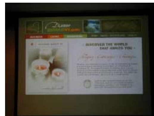
DiscoverSouthwestNY.com Launch February 2004