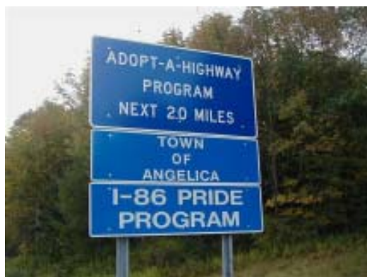
I-86 PRIDE Program First PRIDE Project