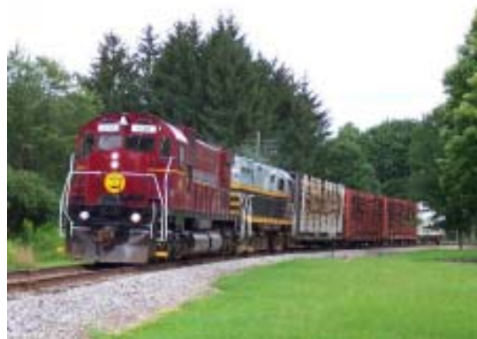
Increased traffic on the Southern Tier Extension Railroad

The Community GIS Program saw a 40 percent increase in membership by adding five new communities. These communities were added through a special partnership program with Cattaraugus County. The new