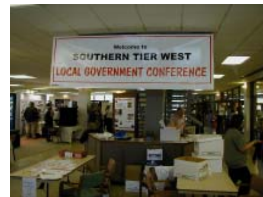
Local Government Conference May 2004

During 2004, Southern Tier West served as a review site for the final EIS Revised Section 4(f) Evaluation for the Route 219 Project . Southern Tier West regularly receives updates from New York State Department of Transportation (NYSDOT) Region 5 as to the status of the Route 219 plan. Southern Tier West supports the four-lane limited access, free-way plan and will continue to follow its progress.