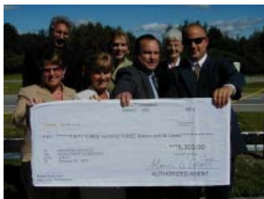
I-86 PRIDE Program ALCOA donates to Randolph Project

Another more recent Southern Tier West accomplishment is our DiscoverSouthwestNY.com regional marketing initiative. In just one year since its launch, more than a quarter of a million visitors have accessed the website. As the official "I Love New York" site for the three-county area,