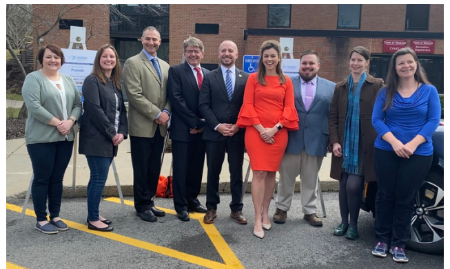
Representatives from the DEC, the Towns of Manlius, Owasco, and Richland and the Village of Pulaski celebrate Climate Smart Communities Certification achievements at a press event, May 24, 2022

NETWORK community leaders share best practices learned through program participation