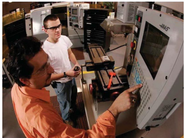
Goal 2: Jamestown Community College's Manufacturing Technology Institute was funded in part with ARC grants.